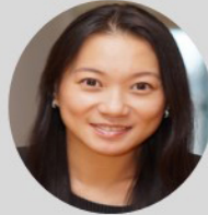
Speaker: Elsie Yan Hong Kong SAR China